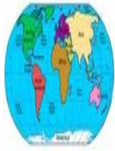
Pray For the World.