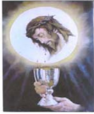
This I did for you