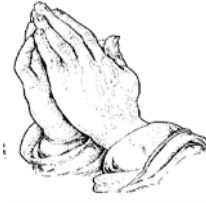
Lifting Up Holy Hands.